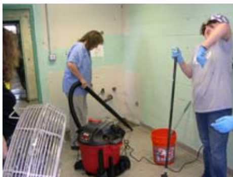
Volunteers help out at the St. Bernard Parish Animal Shelter.

Welcome to the October 2007 edition of the LSU SVM's e-mail newsletter. In this issue, we'll talk about how SVM faculty, staff and students help out in St. Bernard Parish , an LSU police dog saved at the VTH&C , new faculty members , the new alumni & public programs coordinator , accomplishments of faculty and alumni , the Stallion Service Auction , the SVM Annual Conference , upcoming Continuing Education events at the SVM, supporting the SVM , the fall issue of La Veterinaire , upcoming events , and classified ads .