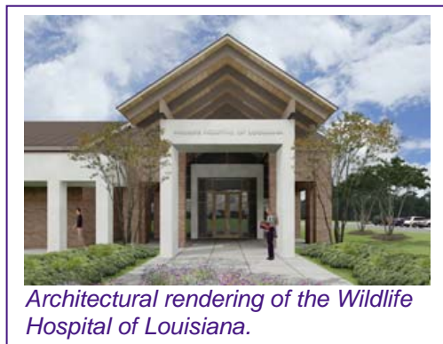
Architectural rendering of the Wildlife Hospital of Louisiana.