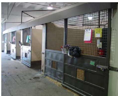
The SVM barn is getting new stall fronts to improve the look of the barn and service to patients.