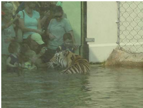
LSU's new tiger introduces himself to some Tiger fans.

Sadly, personnel and funding shortages are common among animal rescue programs dependent primarily on private donations. LSU has been advised by the USDA that the noncompliant items have been addressed by Great Cats. Indeed, the situation only highlights the benefit to the animal of coming to LSU where there will be adequate resources, provision of excellent care and a clean environment.