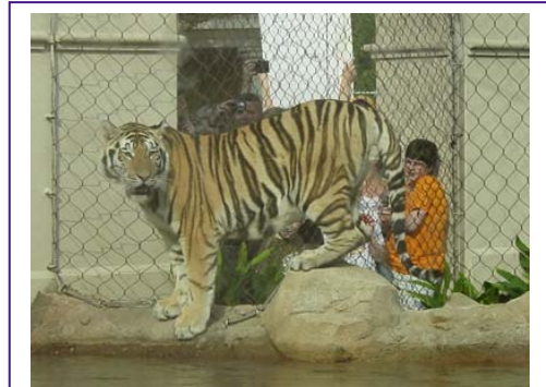
LSU's new tiger checks out his new home. He was released into the outside portion of his tiger habitat on September 1.

The two-year-old male Bengal tiger comes to LSU from Great Cats of Indiana, a nonprofit sanctuary and rescue facility for big cats and other large carnivores, located in Idaville, Ind. During the university's careful review of Great Cats, LSU veterinarians were advised by expert U.S. Department of Agriculture personnel that this is a reputable and legitimate rescue program. Great Cats does not intentionally breed tigers, and LSU's assessment is that the facility abides by the "guiding principles" of a legitimate sanctuary.