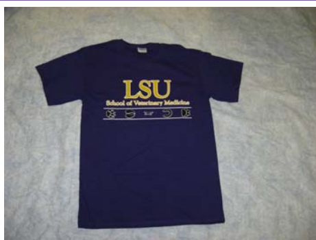
The SCAVMA Bookstore's merchandise can now be viewed on-line.