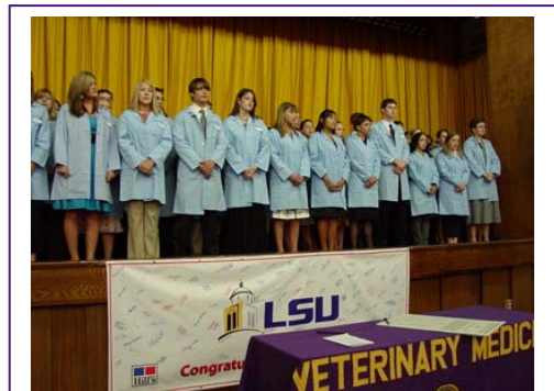
The Class of 2011 takes the Veterinarian's Oath at the Coating Ceremony on August 22.