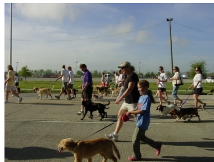
One hundred and thirty-four people and their pets participated in the one mile fun run/walk.

Proceeds benefited the Student Chapter of the American Veterinary Medical Association. The mission of the Hill's Great Rover Road Run is to spread awareness about the importance of proper nutrition and exercise for animals and the negative side effects of animal obesity. Puppies minus pounds are better!